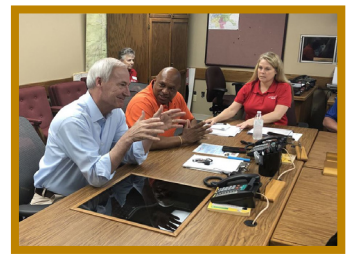
Historic Flood Response