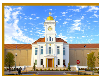
Remodeled the Courthouse