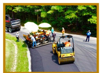
New Road Equipment