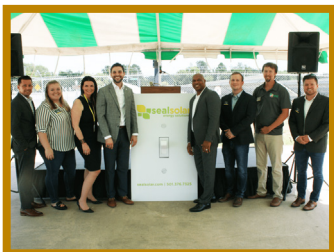
1st County to Go Solar

Employee bonuses for 3 years in a row and the largest raises ever given in the history of the county.