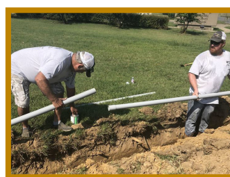
Cutting County Phone Costs