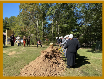
Health Department Groundbreaking