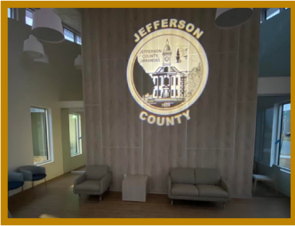
New Coroner's Office