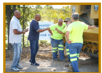
Employee Bonuses and Raises