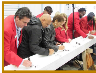
Saracen Casino Resort Rooftop Ceremony