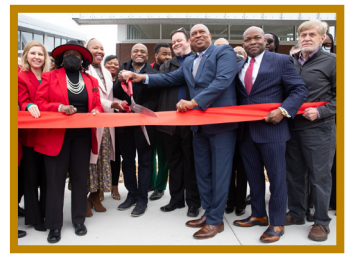
Coroner's Office Ribbon Cutting