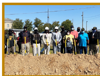
Veteran's Administration Groundbreaking