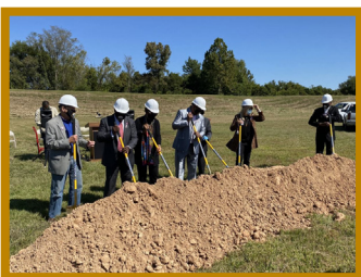
Coroner's Office Groundbreaking

Simmons Bank supported the 3 new construction projects with a $1 million dollar pledge. The county applied for and received $700,000 in competitive grants from the State Health Department, and Relyance Bank supported the projects with a $40,000 pledge. Buildings were named after African Americans from Jefferson County who served locally and nationally.